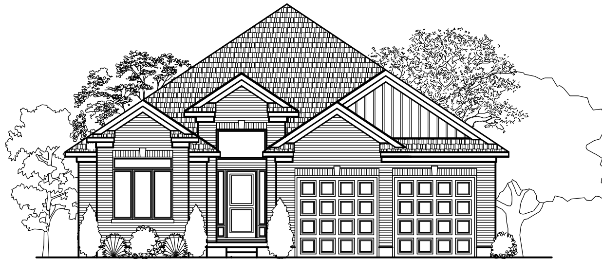
"STAPLETON" FRONT ELEVATION TOTAL APPROX.- 2011 SQ FT.