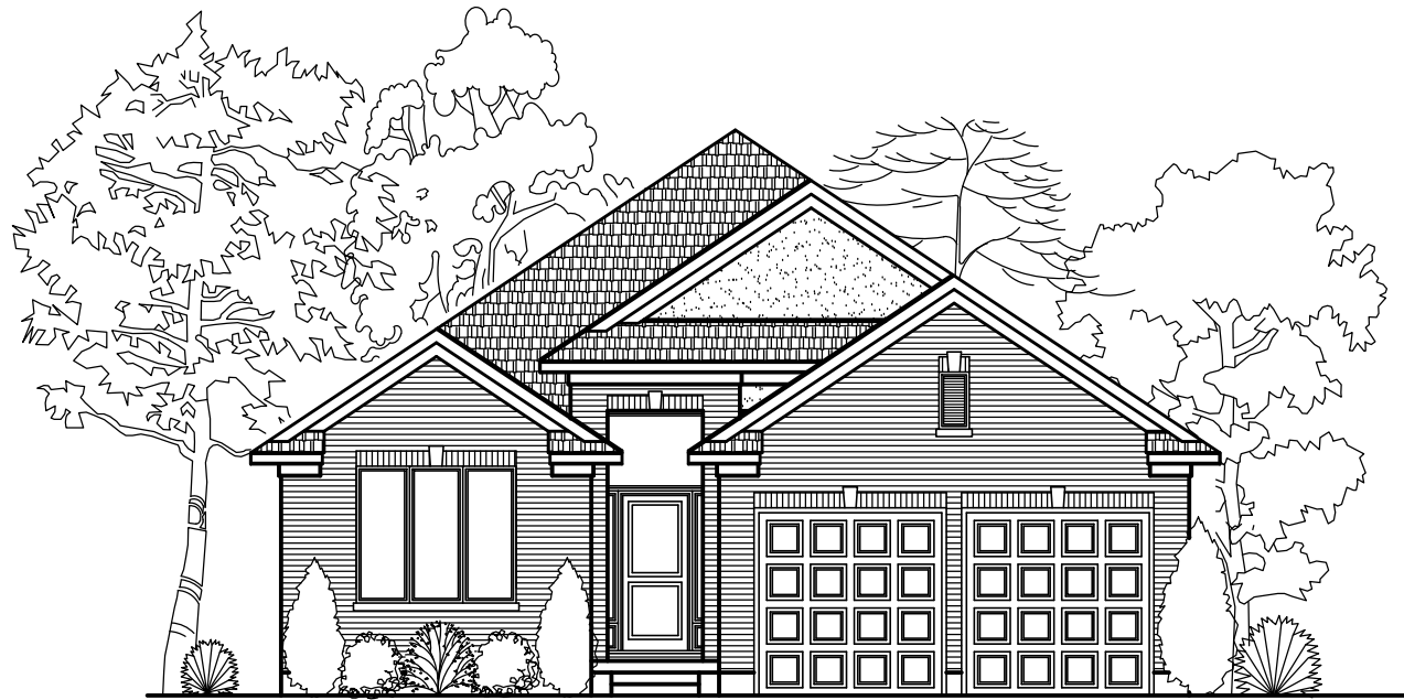
"SANTA FE" FRONT ELEVATION TOTAL APPROX. - 1708 SQ FT.