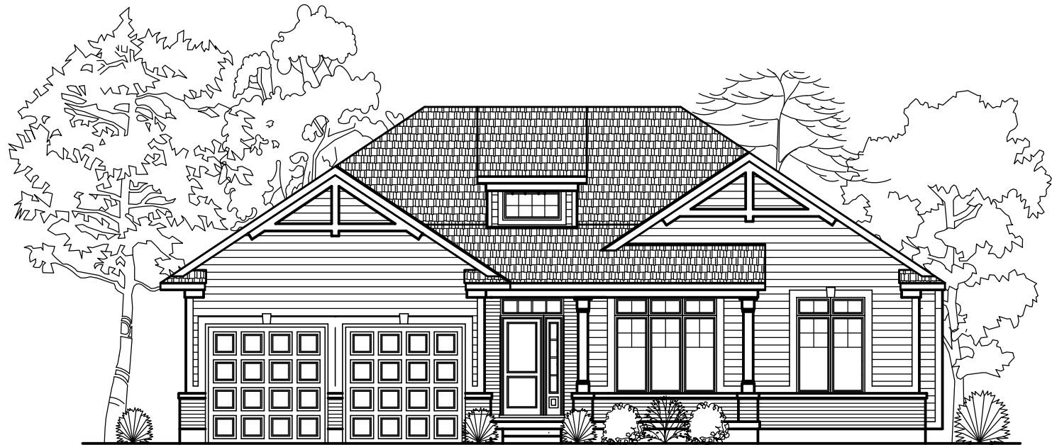
"LAKELAND" FRONT ELEVATION TOTAL APPROX.- 1755 SQ FT.