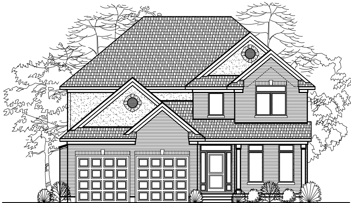
"DURHAM" FRONT ELEVATION TOTAL APPROX.- 2631 SQ FT.