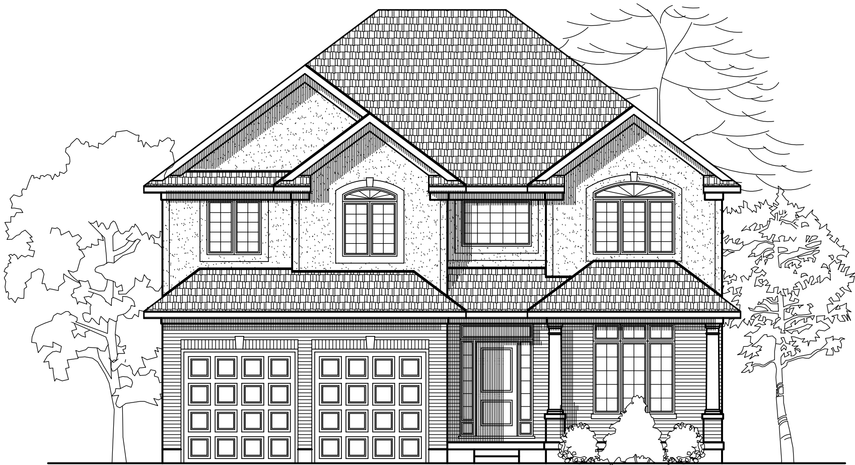
'ACADIA' FRONT ELEVATION TOTAL APPROX.- 2534 SQ FT.