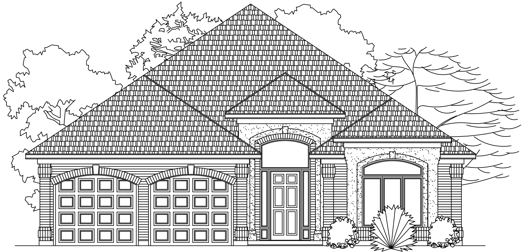
SEDONA FRONT ELEVATION APPROX. 1811 SQ. FT.