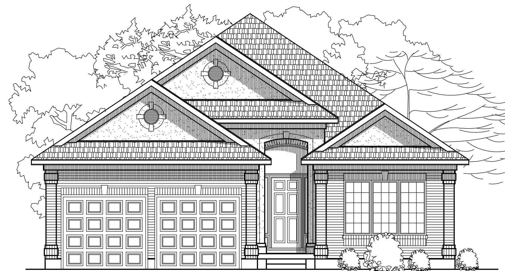
SANTA FE FRONT ELEVATION-"B" APPROX. 1681 SQ. FT.