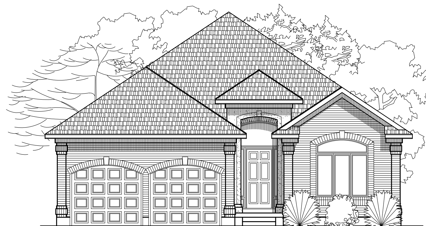
SANTA FE FRONT ELEVATION-"A"