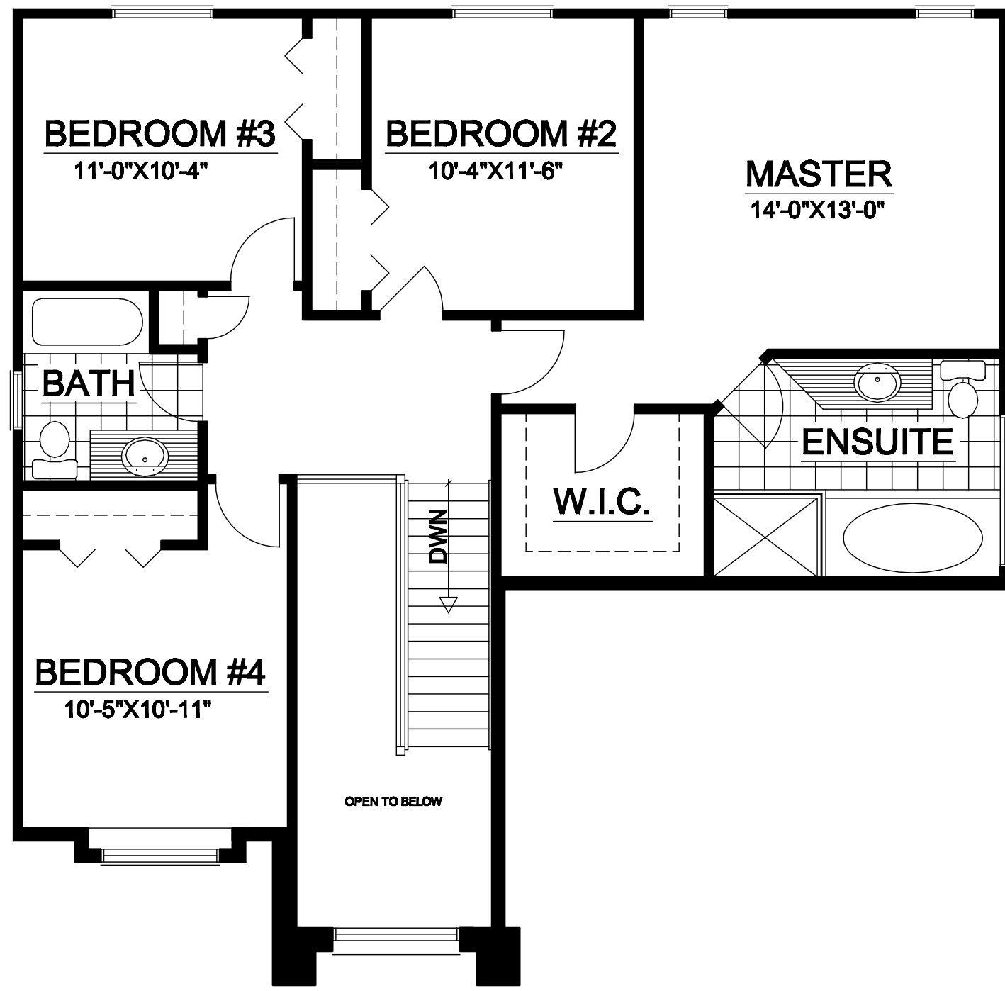
THE "PRESCOTT" SECOND FLOOR PLAN APPROX. 2140 SQ. FT.