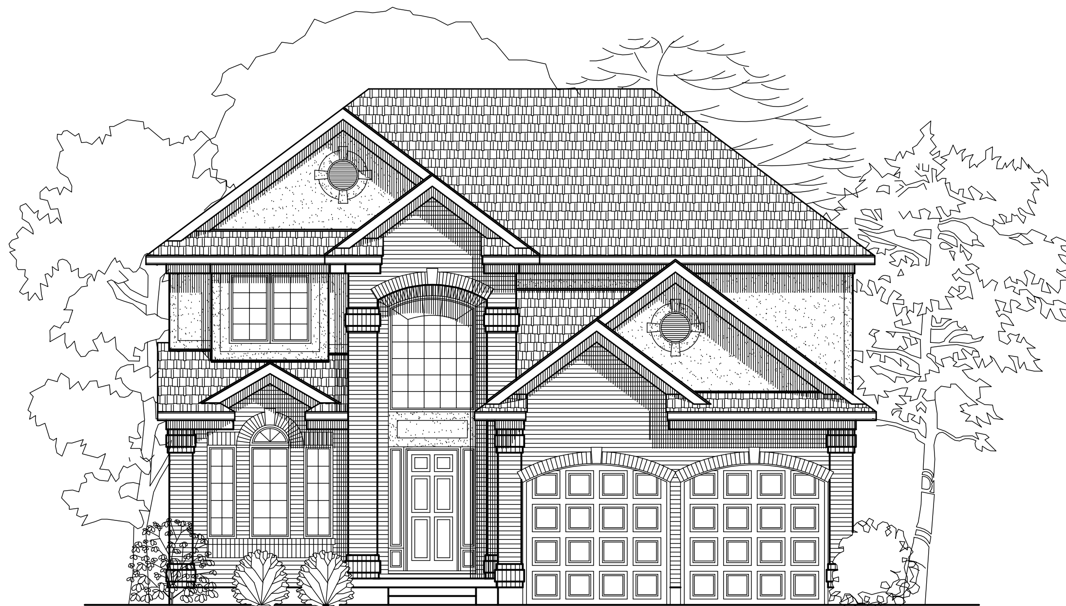
THE "PRESCOTT" FRONT ELEVATION APPROX. 2140 SQ. FT.