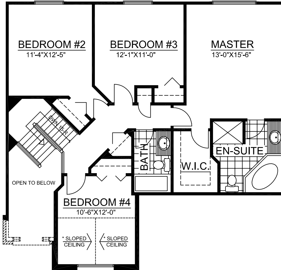
HEATHCOTE SECOND FLOOR PLAN APPROX. - 2509 SQ. FT.